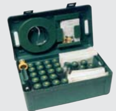
Castrol Predict Sampling Kit