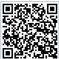
Labcheck® Core & Optional Tests

For more-detailed information on the Labcheck® program, please scan the QR codes below: