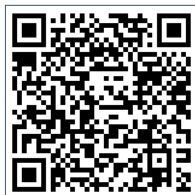
Labcheck® Test Packages

(Tests offered may vary by Labcheck® program type)