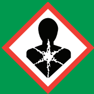
SERIOUS HEALTH HAZARD SYMBOL: HEALTH HAZARD

Here are some examples of the pictograms along with an indication of their meaning.