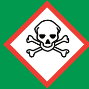
ACUTE TOXICITY SYMBOL: SKULL & CROSSBONES