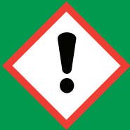
HEALTH HAZARD SYMBOL: EXCLAMATION MARK