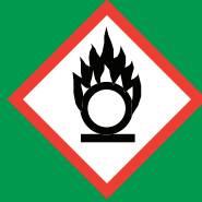
OXIDISING SYMBOL: FLAME OVER CIRCLE