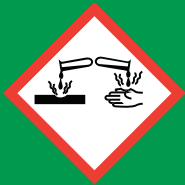
CORROSIVE SYMBOL: CORROSION