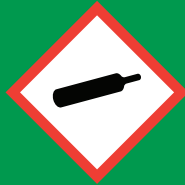
GAS UNDER PRESSURE SYMBOL: GAS CYLINDER