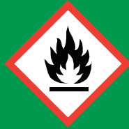
FLAMMABLE SYMBOL: FLAME