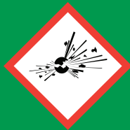
EXPLOSIVE SYMBOL: EXPLODING BOMB