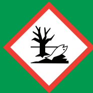
HAZARDOUS TO THE ENVIRONMENT SYMBOL: ENVIRONMENT