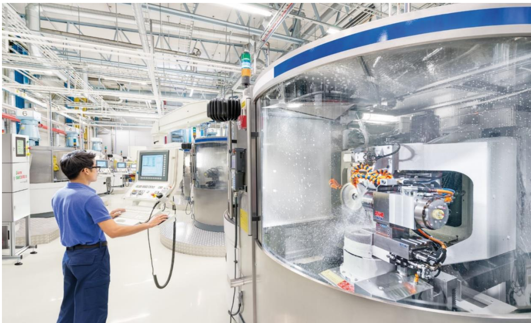
Big data analyses based on real time data enable a longer lifespan for machinery.

But is the 4th Industrial Revolution (4IR) something that will truly help production, or is it only oriented towards companies that are selling services? How can companies benefit from the 4IR? How will the 4IR control and manage the development process? How does the true value of an industrial data strategy become apparent in the age of 4IR? These are all questions which companies in the producing industry must ask - ideally before they invest in hardware, software and services. Optimising profitability will always be one of the main objectives of every company. The industry will and must produce more rapidly and more effectively with less waste, less reworking, more reliability, greater transparency and improved quality. Moreover, the industry will understand its customers immediately better and satisfy them with products that fulfil their individual needs - in order to achieve mass connectivity and make mass adjustments. This should all take place while simultaneously controlling costs.